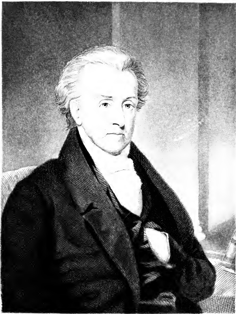
John Cotton Smith